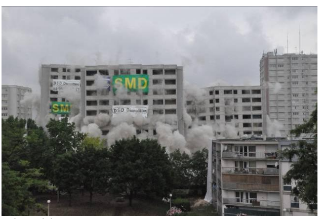
The "blast" 2