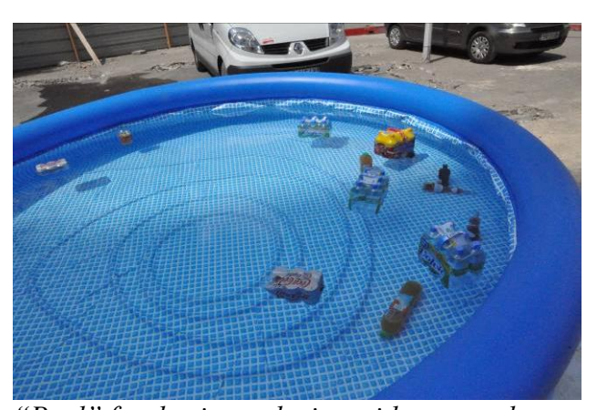
"Pool" for dusting reducing with a second use

The French colleagues used as Explosive "CISALEX", an emulsion in plastic tubes with diameters of 13 and 17 mm and weight of 104 to 190 g/m. The charge was initiated by a detonating cord of 12 g/m, which was tied on the whole length. Only a big column inside was charged with EURODYN. The total weight of the charges summed up to 313 kg.